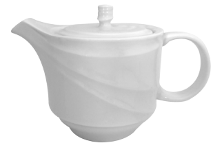
Teapot with Lid