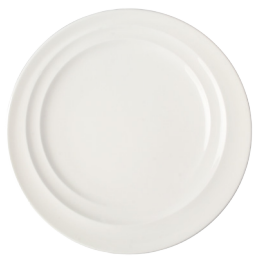
Round Coupe Plate